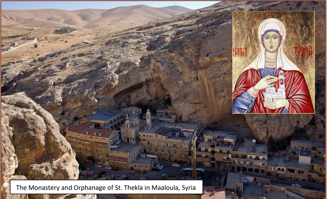
The Monastery and Orphanage of St. Thekla in Maaloula, Syria

VENERABLE SILOUAN OF ATHOS WONDER-WORKING ICON OF THE THEOTOKOS OF THE MYRTLE TREE SYNAXIS OF ALL SAINTS OF ALASKA